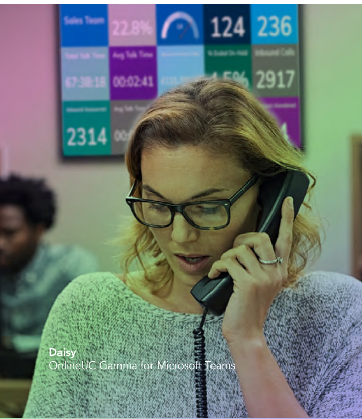
Daisy OnlineUC Gamma for Microsoft Teams